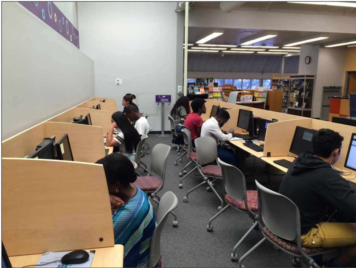
A renovated area in the Resource Center (main library facility) on the Takoma Park/Silver Spring campus with better seating, an expanded work area, and added outlets.

Based on the studies done by the library teams and the anthropology students, planning groups on all three campuses have been able to formulate a number of improvements to existing libraries.