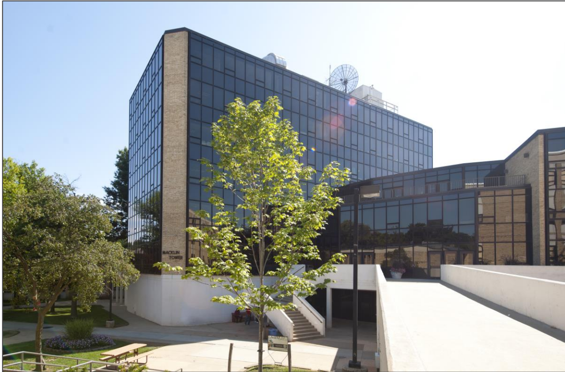
The Gordon and Marilyn Macklin Tower, which houses the library on Montgomery College's Rockville campus.

Perhaps the most significant lesson to be drawn from these studies is that community college students are exceptionally diverse both in their demographic characteristics and in the pathways they are following through the educational system. Their lives are complicated and they face a wide range of financial, linguistic, and societal obstacles. Some community college students are on a two-year fast track to a four-year college and have the personal and family resources to succeed. But others are in a very different situation, as documented in the Ithaca S+R reports cited above and the ethnographic studies described here. They may be recent immigrants who are still learning English, they may be veterans returned from service overseas, they may be holding down a low-paying job while developing the skills for a better one. Many come from modest backgrounds and are the first in their families to get anything more than a high school education. They may have children of their own, or nieces and nephews, or aging parents or grandparents who need their care, so they squeeze in their classes amid all the other responsibilities. To know these students is to understand that their needs may run a very broad gamut and that while their use of scholarly literature may not be as great as at other institutions, their need for the library may be even greater. To know these students is to want to serve them even more and even better.