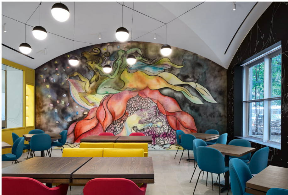
Chris Ofili, The Sorceress' Mirror , (2017)

Coinciding with its fiftieth anniversary, MCA Chicago has completed a renovation that elevates communal spaces in the museum.