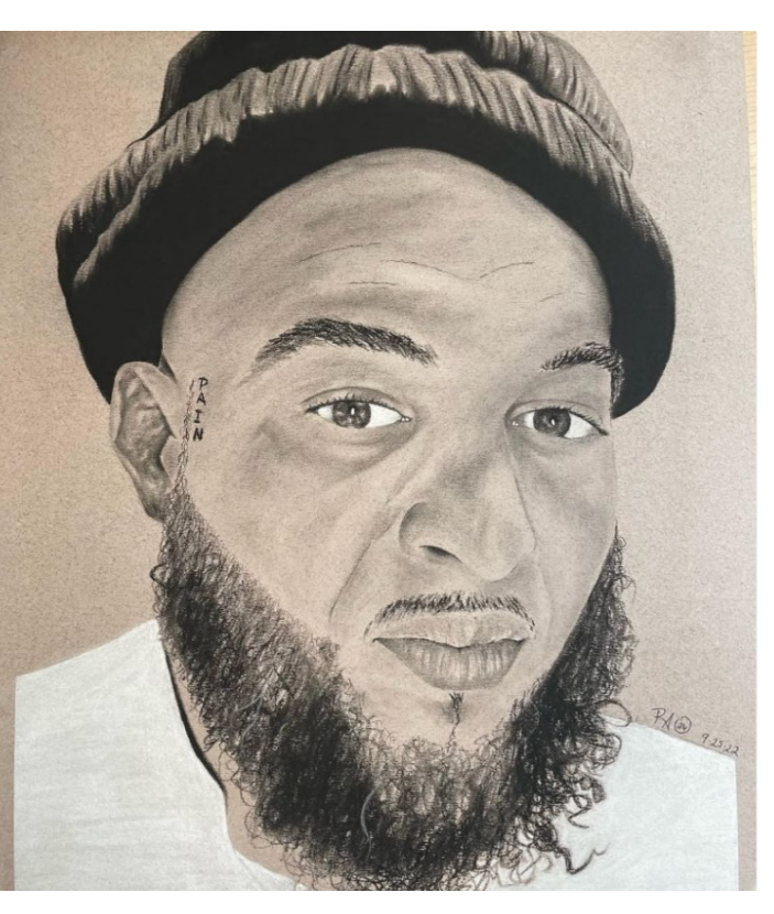
"Pain Looks Like This," by Robert Odom6

Our longer-term vision is to lay the groundwork for future projects aimed at providing training and resources to community organizations that will enable them to not only better care for and make accessible the materials under their care, but also connect them to more traditional memory institutions that are interested in this material. We hope the evidence collected during this exploratory project is a catalyst for that more significant implementation. Too often, the narratives and public imagery that surround prison are shaped by media forces with little input from the directly impacted. Likewise, humanistic study of mass incarceration has been constrained by a lack of materials representing the perspectives of the incarcerated. In seeking to preserve and make accessible work created by incarcerated people, we believe that they will, in turn, be more able to shape the narratives told about them and legitimize their experiences as a critical part of the nation's heritage and history.